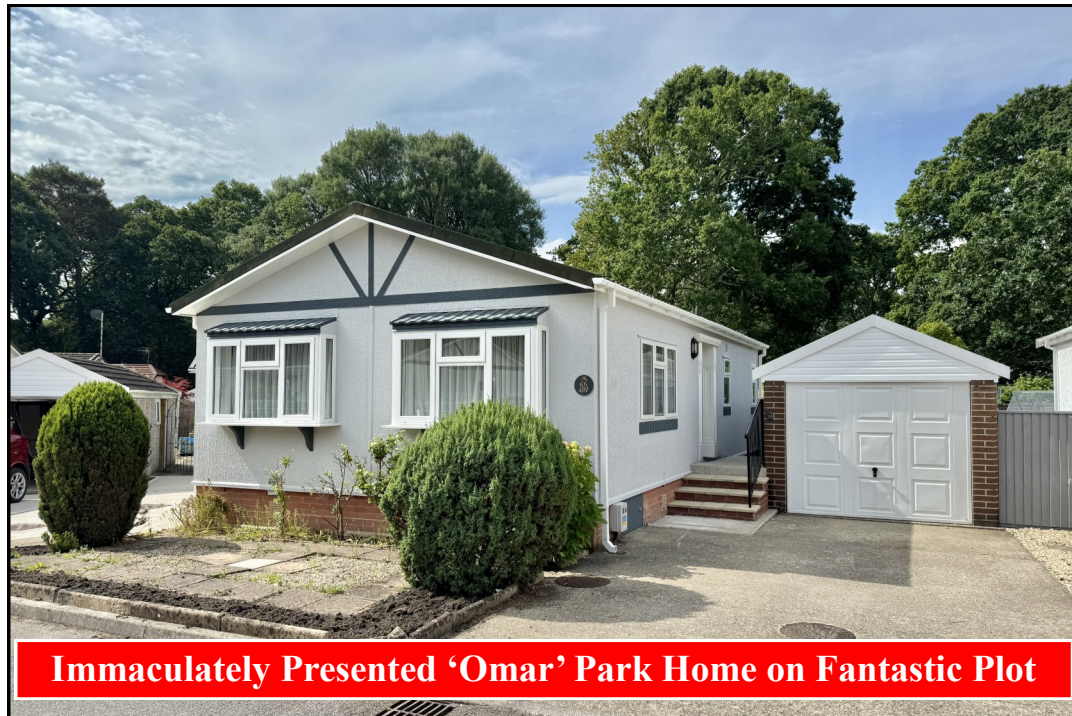
Immaculately Presented 'Omar' Park Home on Fantastic Plot

65 Dewlands Park, West Close, Verwood, Dorset. BH31 6PR