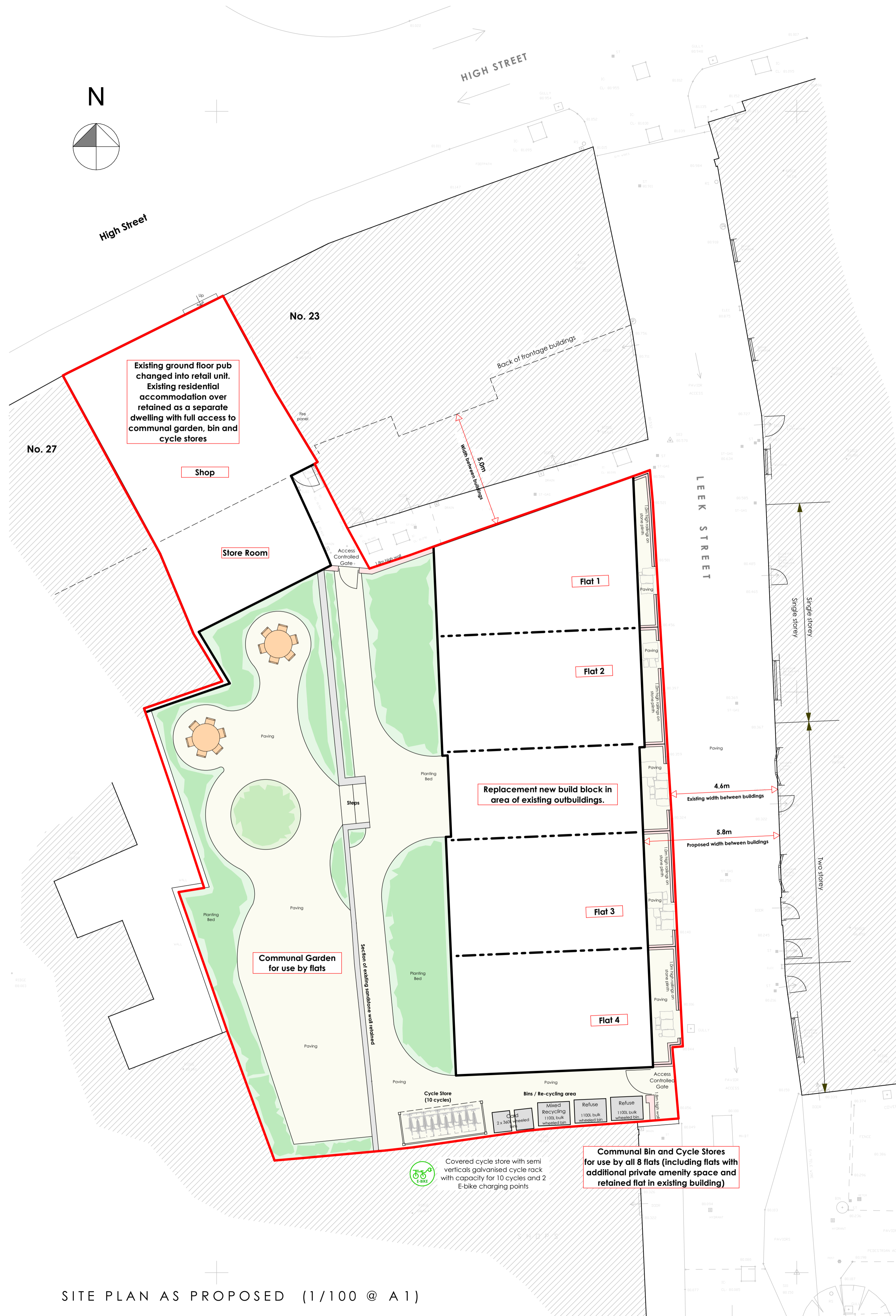
SITE PLAN AS PROPOSED (1/100 @ A1)