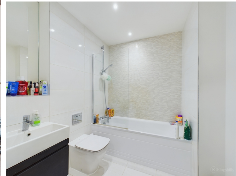
Castle House, Desborough Road, High Wycombe, Buckinghamshire, HP11 2FP