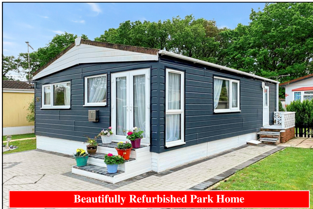
Beautifully Refurbished Park Home

50 Gladelands Park, Ringwood Road, Ferndown, Dorset. BH22 9BW