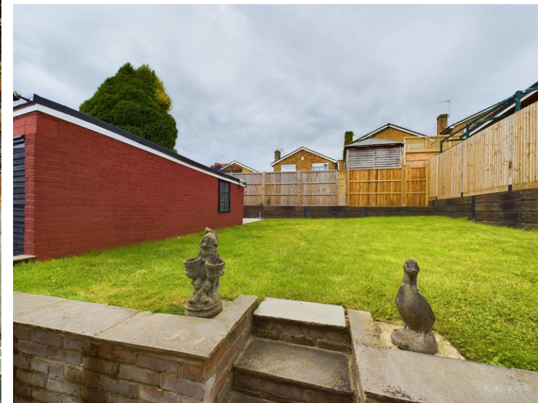
16 Kendalls Close, High Wycombe, Buckinghamshire, HP13 7NN