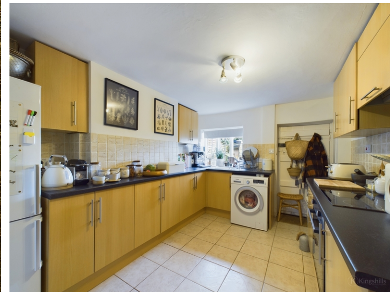
Mid Elm Cottage, Elm Road, Penn, High Wycombe, Buckinghamshire, HP10 8LF