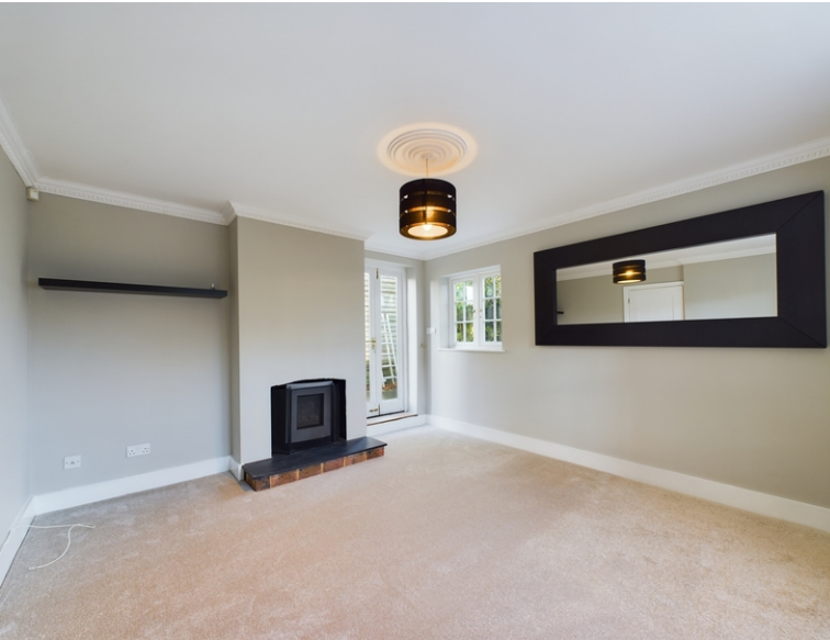
Burkes Cottage, Aylesbury End, Beaconsfield, Buckinghamshire, HP9 1LS