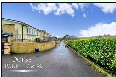
DORSET PARK HOMES

Wonderful Rural Setting close to Jurassic Coast