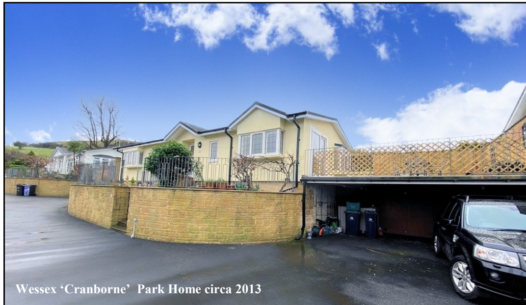
Wessex 'Cranborne' Park Home circa 2013

2 Upton Glen Park, Upton, Ringstead, Dorchester, Dorset. DT2 8NE