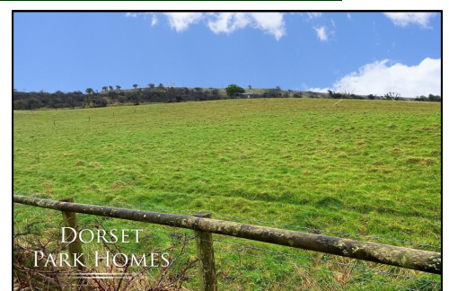
DORSET PARK HOMES