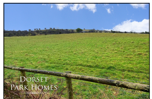
DORSET PARK HOMES