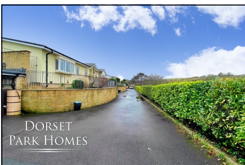
DORSET PARK HOMES

Wonderful Rural Setting close to Jurassic Coast