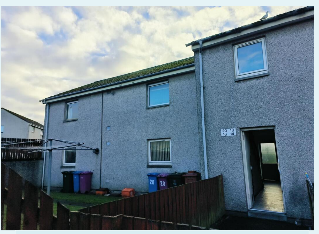
Strictly No Pets & No Smokers Unfurnished 2 Bedroom Ground Floor Flat

Hallway, Large Walk-in Style Cupboard which houses the boiler (to be utilised only to store unused furniture items provided with the Flat), Lounge, Kitchen, Bathroom & 2 Bedrooms Free Standing Fridge Freezer, Cooker, Washing Machine & Dishwasher included with Property Grassed Enclosed Garden Area to rear of property Block Built Storage Shed to Communal Parking Area