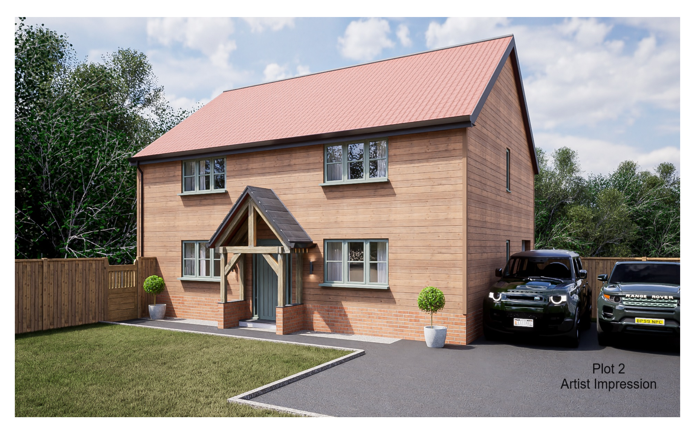
High Street, Harston, Cambridge