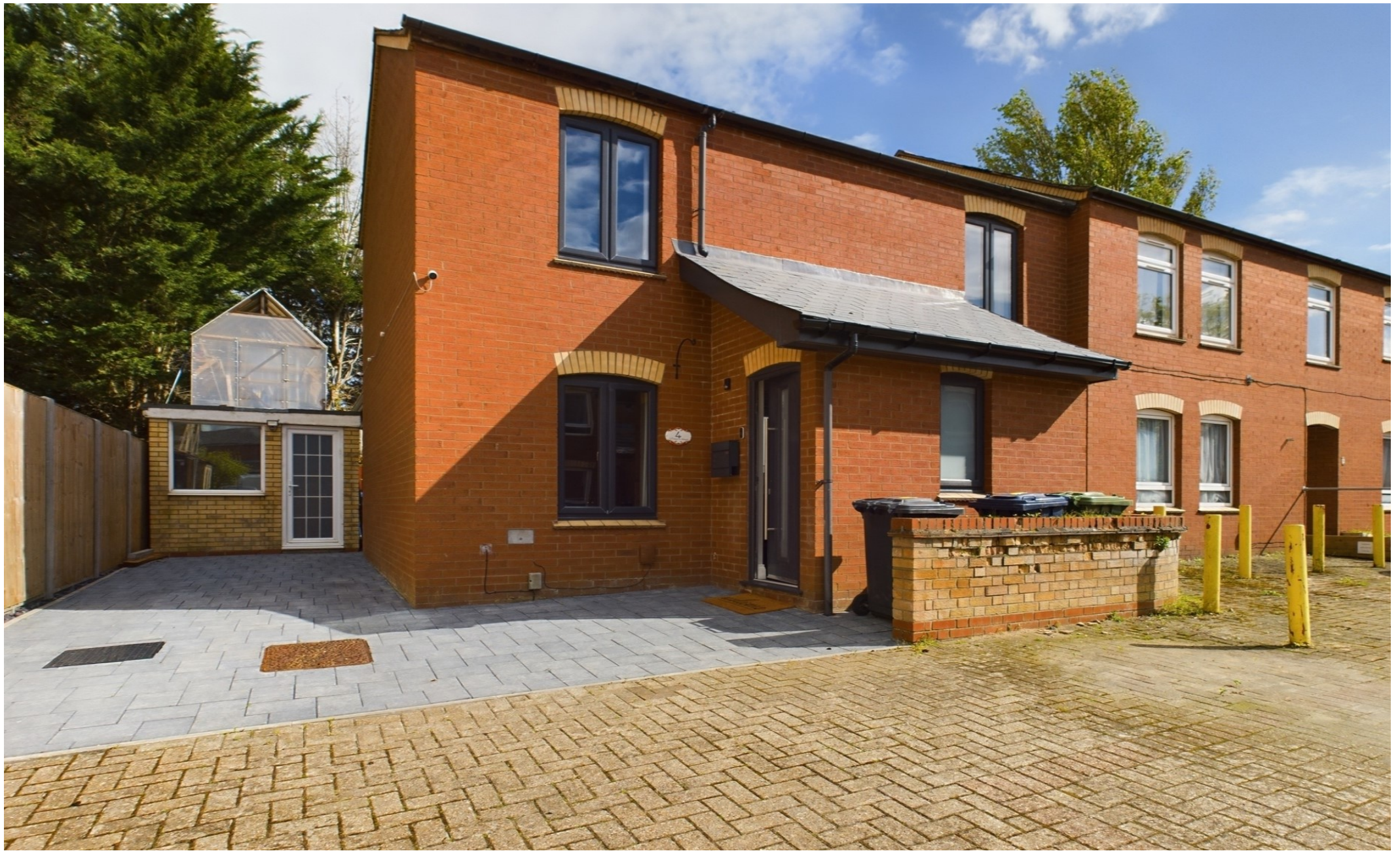
Ongar Court, Cambridge CB5 8UH