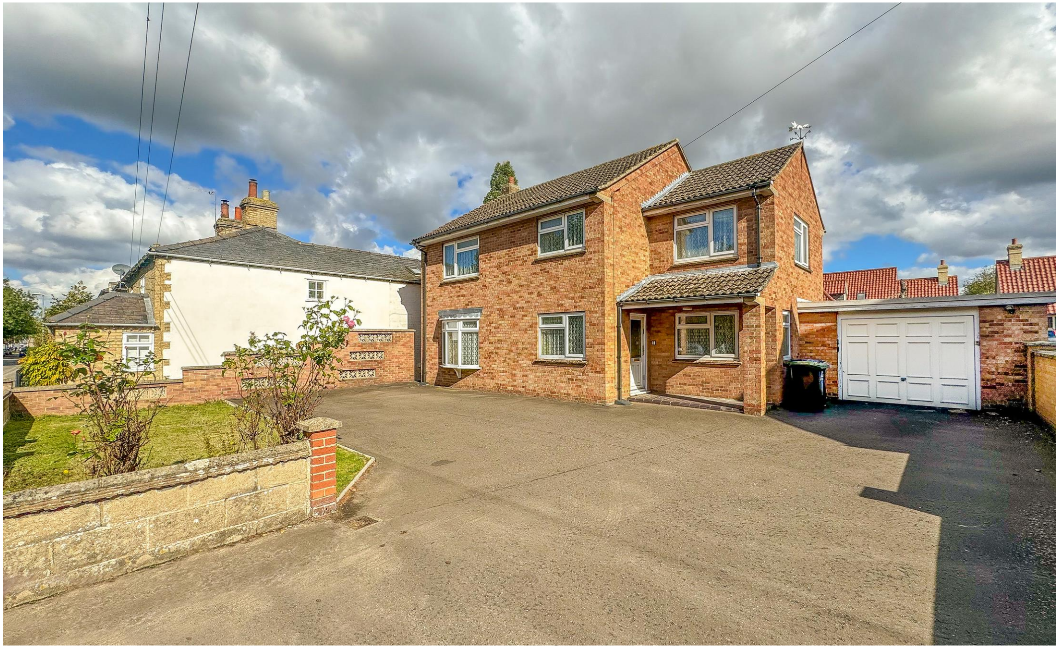
The Causeway, Burwell