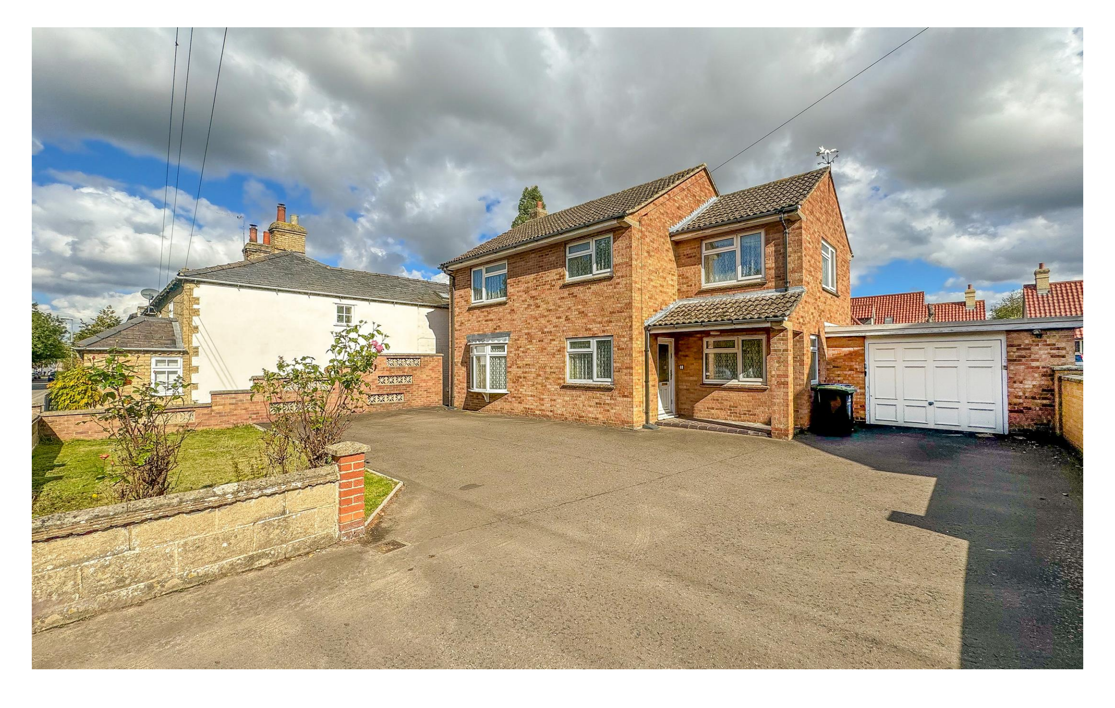
The Causeway, Burwell