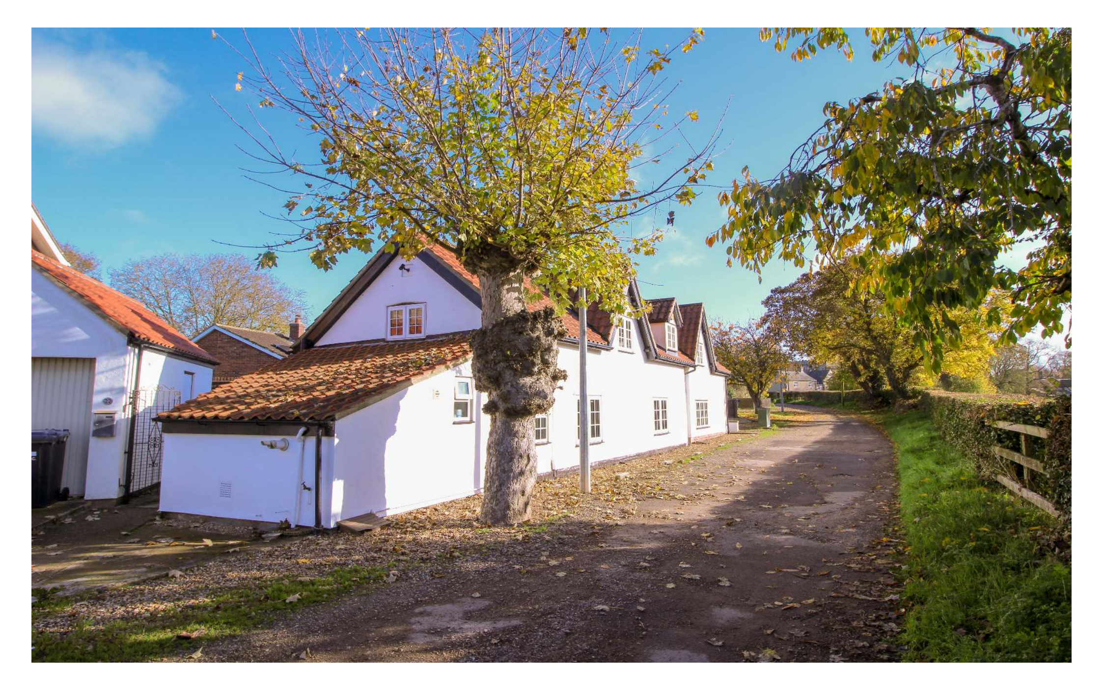
Spring Close Burwell Cambridgeshire