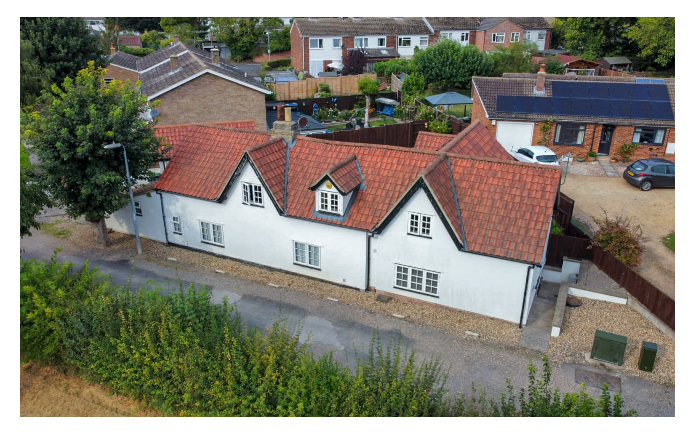
Spring Close Burwell Cambridgeshire