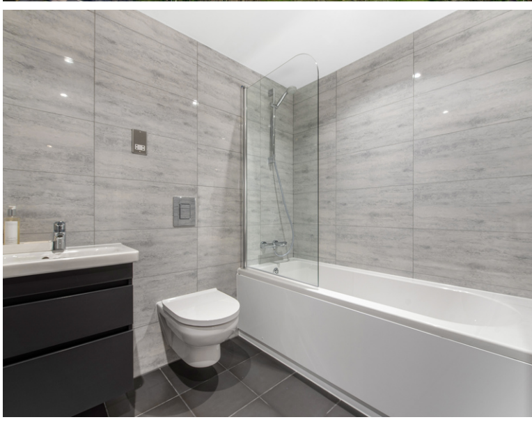
Flat 47, The Residence, Wycombe Road, Saunderton, High Wycombe, HP14 4EA