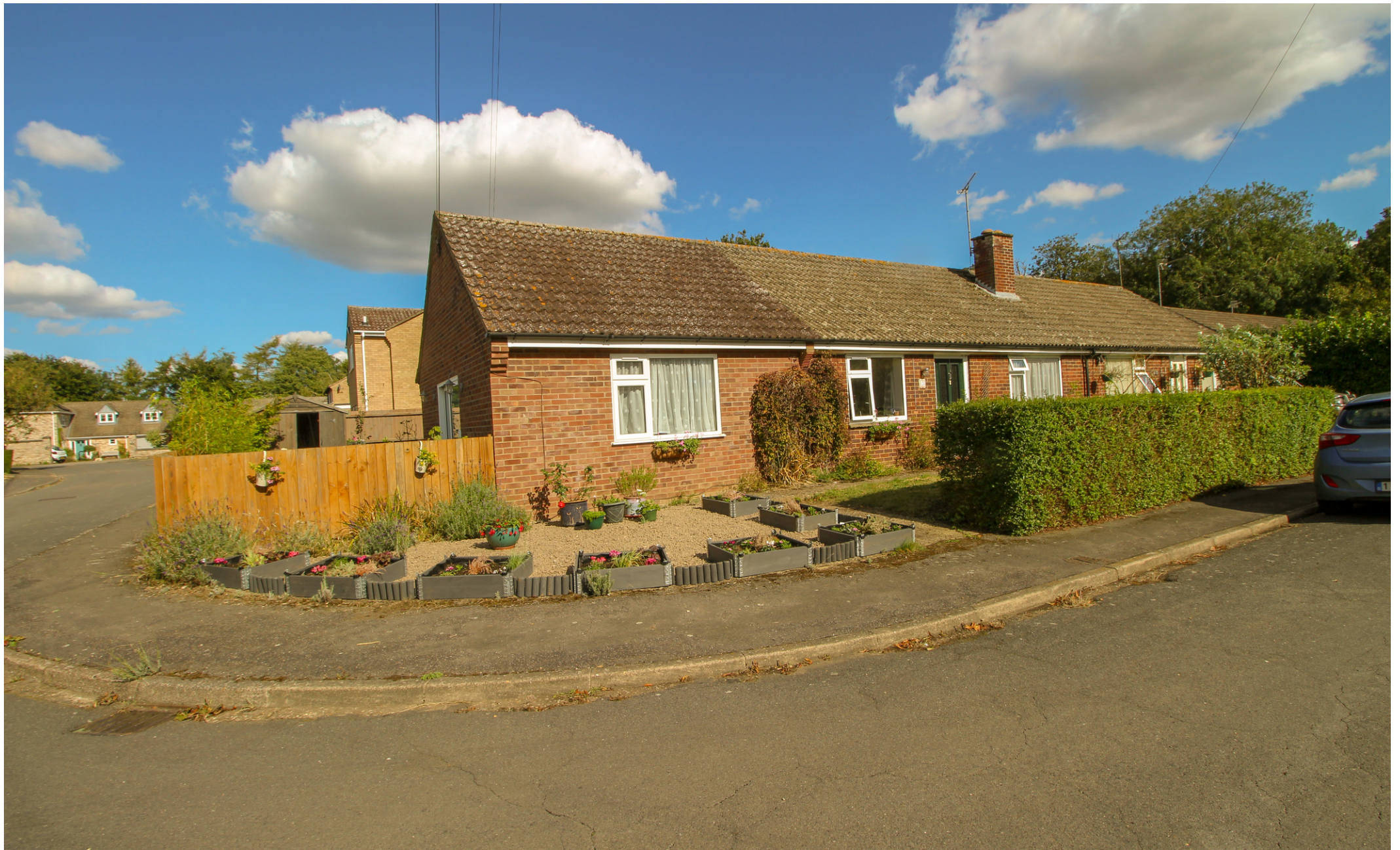
Vicarage Close, Dullingham