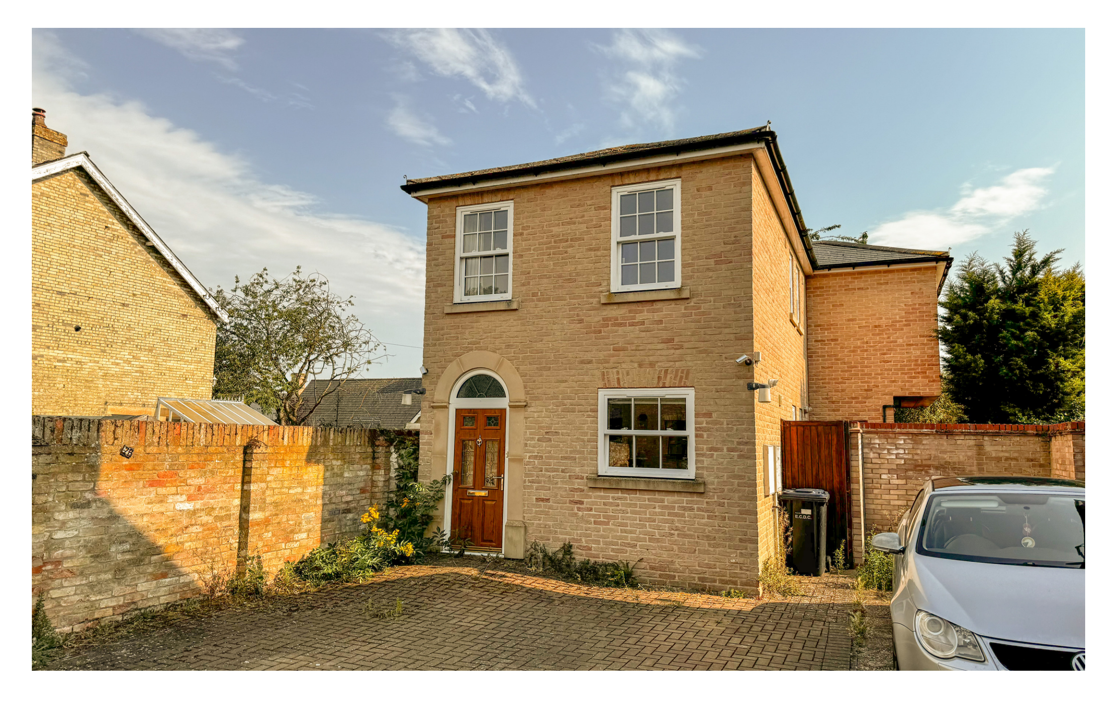
White Hart Lane, Soham