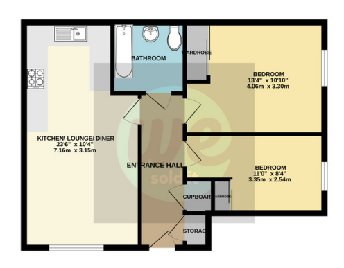
TOTAL FLOOR AREA: 597 sq. ft, (55.4 sq.m.) approx. White every steep; has been made to ensure the accuracy of the floorpian constance/these, necessariants of aboxs, includes, course and any other been see any operational and on responsibly is balan for any entry, omission or mis-steement. This pain is for floorable purposes only and should be used as such by any prespective purchases. The services, symme and applications shown have as then stread and no pulsariants.