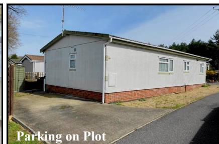
Parking on Plot