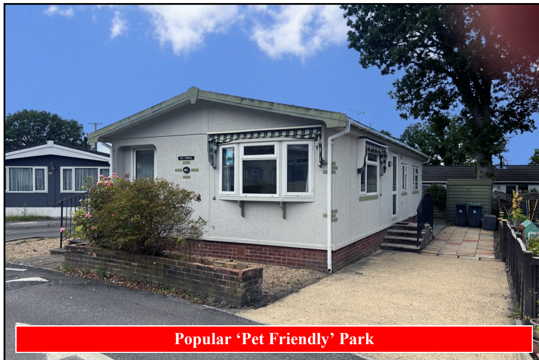
Popular 'Pet Friendly' Park

86a The Avenue, Oaktree Park, St Leonards, Ringwood. BH24 2RJ