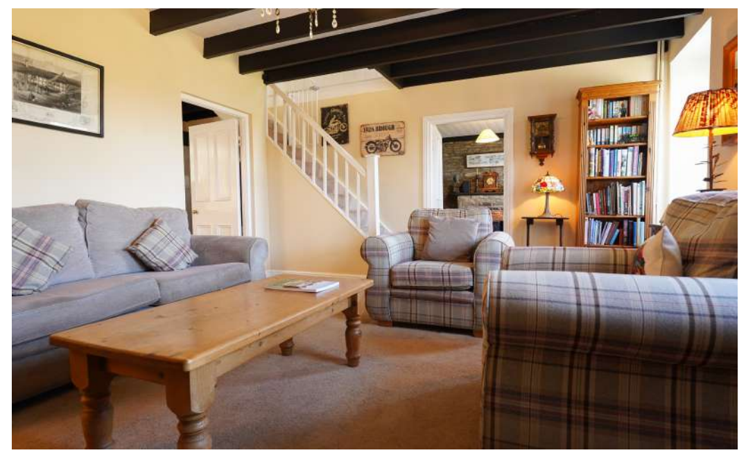
Video Link: <a href="https://youtu.be/At8c_EgqZOA">https://youtu.be/At8c_EgqZOA</a>