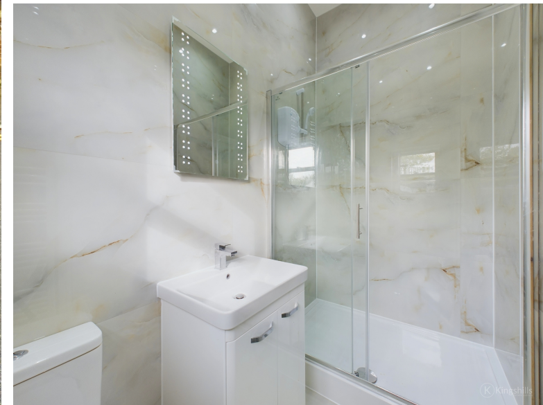
Flat 1, Stuart Lodge, Stuart Road, High Wycombe, Buckinghamshire, HP13 6AG