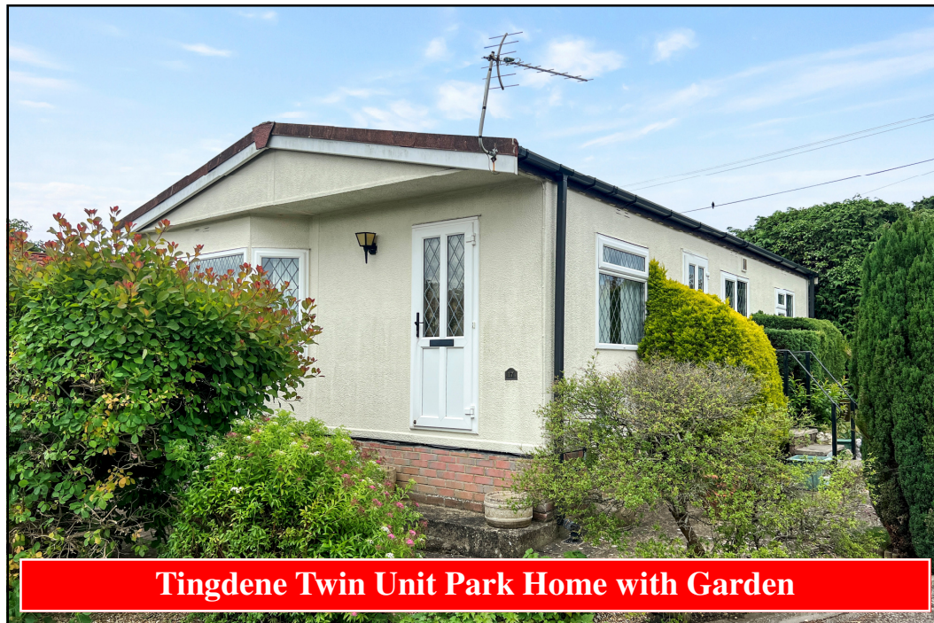
Tingdene Twin Unit Park Home with Garden

17 Doveshill Park, Barnes Road, Ensbury Park, Bournemouth. BH10 5AJ