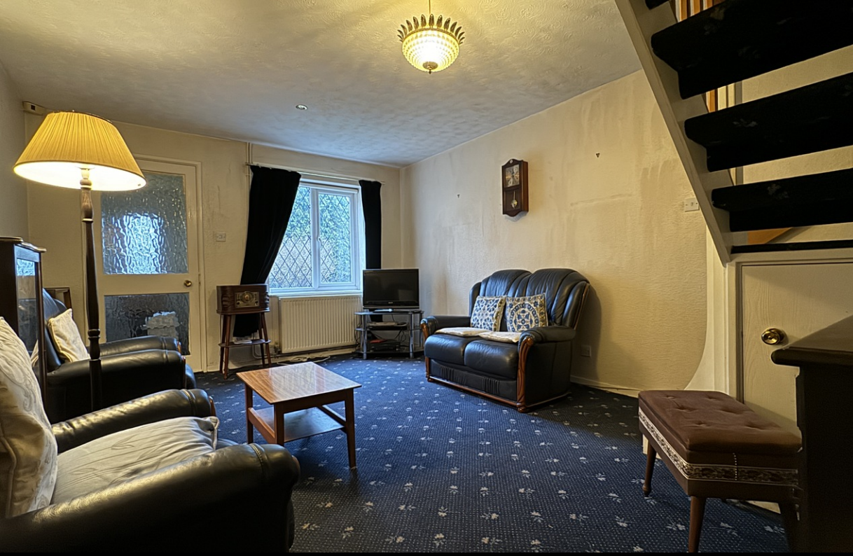
Our View "A two bedroom house set in a quiet cul-de-sac"