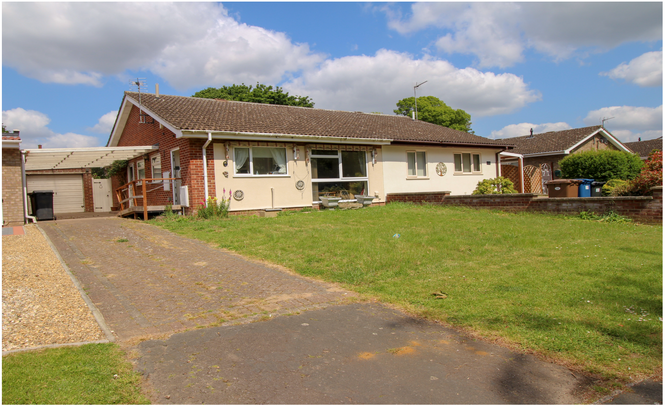
Suffolk Way, Newmarket