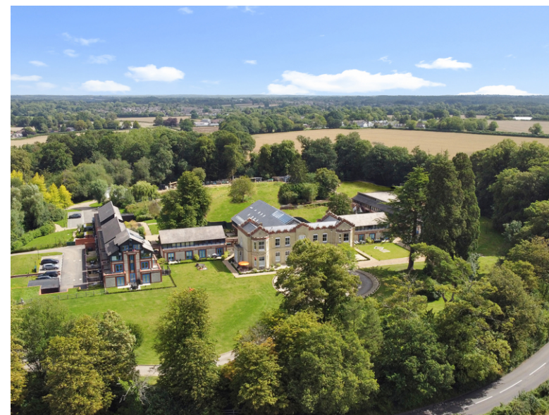
Flat 49 Uplands House, Four Ashes Road, Cryers Hill, High Wycombe, HP15 6DY