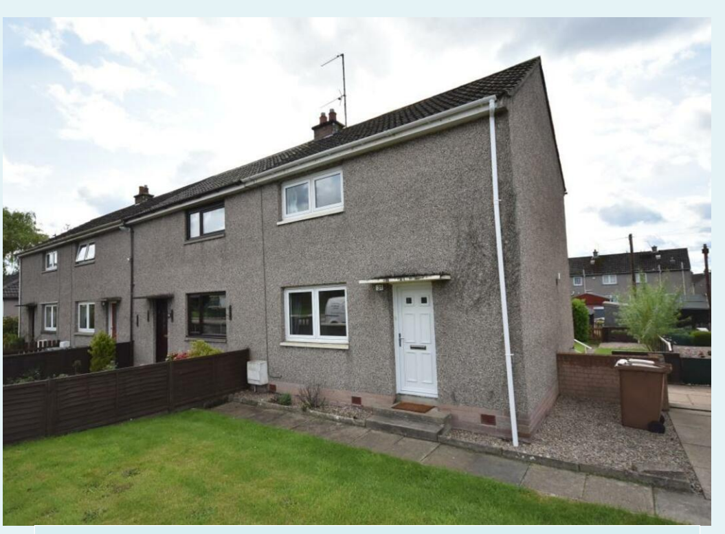
Unfurnished 2 Bedroom End Terraced House No Pets & No Smokers

Hallway, Lounge & Kitchen with integrated hob & oven, 2 Bedrooms & Bathroom Rear Garden