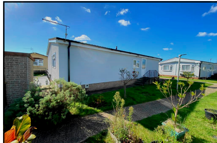
Pitch Fee: approx £198.63 per month Subject to Annual Review Council Tax Band: 'A' Tenure