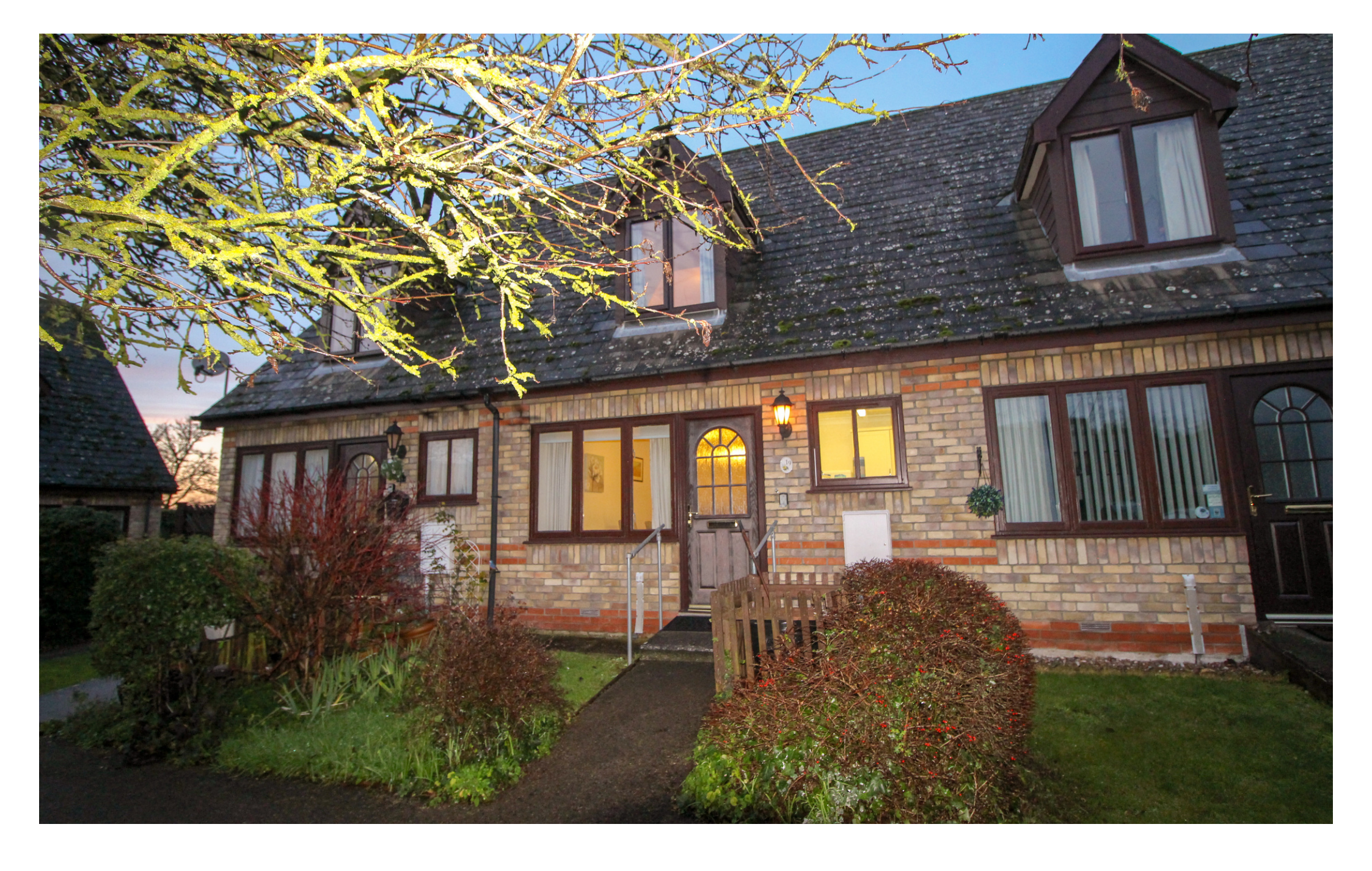
Ash Grove Burwell Cambridgeshire