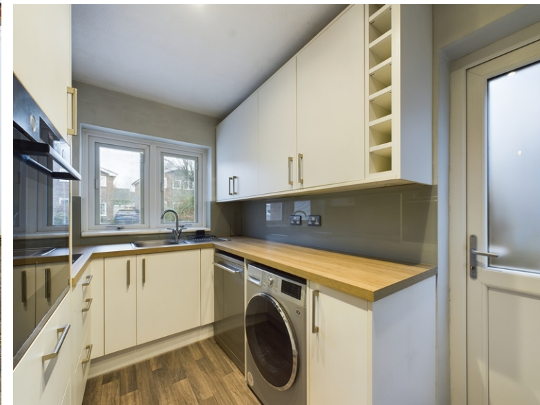
5 Weathercock Gardens, Holmer Green, High Wycombe, HP15 6TA