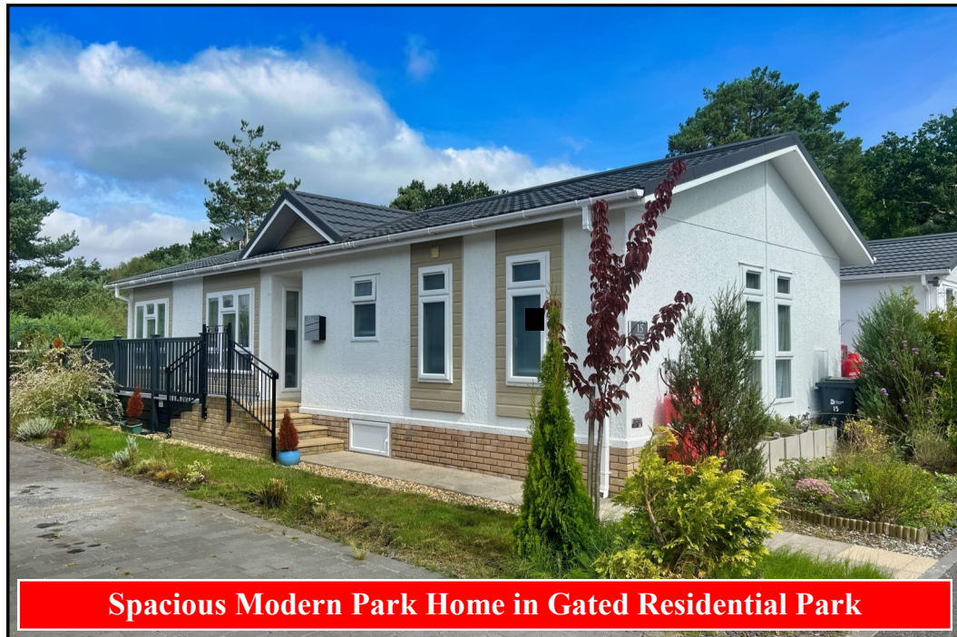
Spacious Modern Park Home in Gated Residential Park

15 Juniper Way, Deer's Court, Horton Road, Three Legged Cross, Wimborne. BH21 6FH