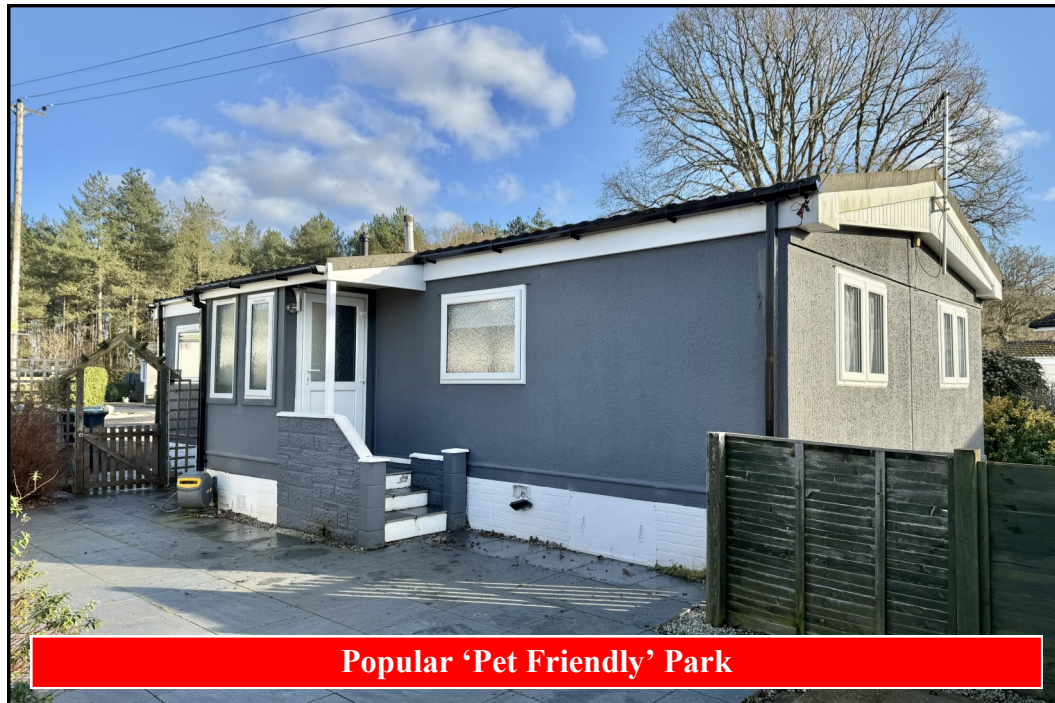
Popular 'Pet Friendly' Park

86 The Avenue, Oaktree Park, St Leonards, Ringwood. BH24 2RJ