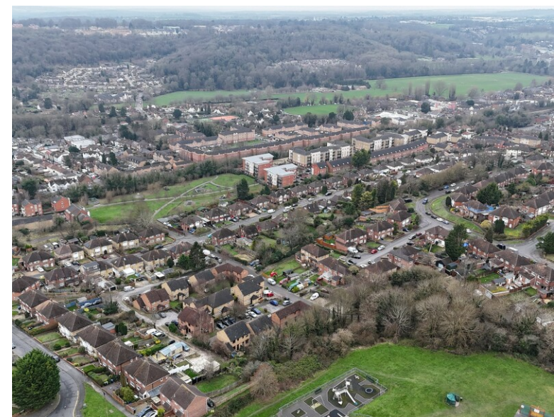
31 Cairnside, High Wycombe, Buckinghamshire, HP13 7SB