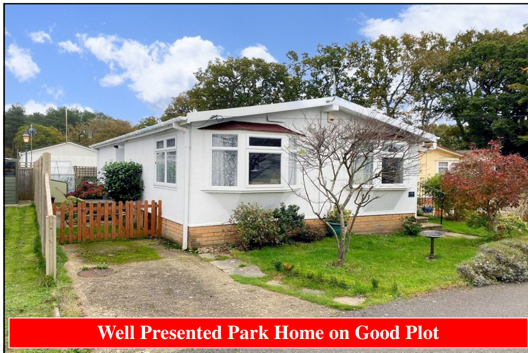
Well Presented Park Home on Good Plot

132 East Drive, Oaktree Park, St Leonards, Ringwood BH24 2RS