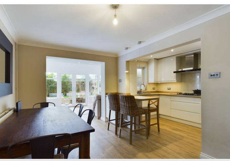
Melvin Way, Histon, CB24 9HY

£1,450 pcm Furnished 1 Bedrooms Available from 02/01/2024