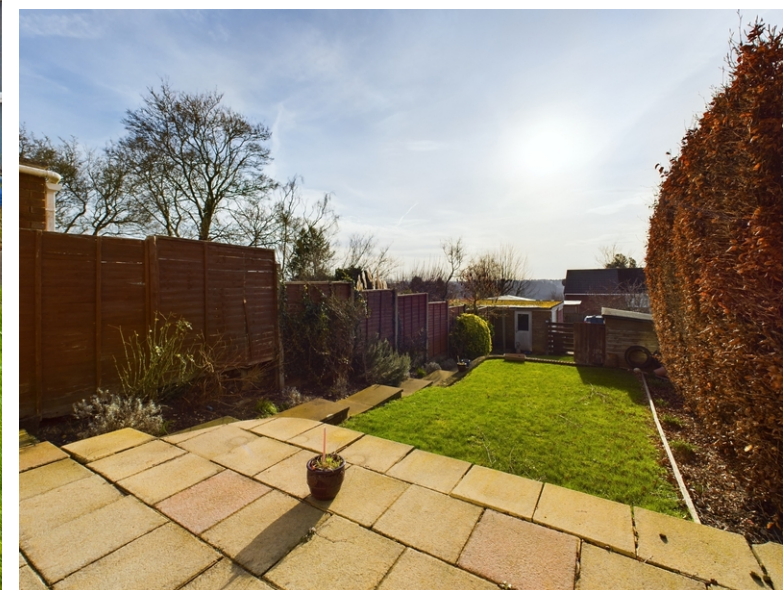
20 Woodcote Green, Downley, High Wycombe, Buckinghamshire, HP13 5UN