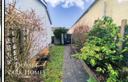
Pitch Fee: approx £231 per month Subject to Annual Review Council Tax Band: 'A' Ten