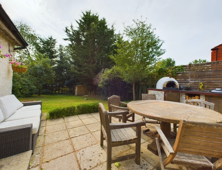
156 Little Marlow Road, Marlow, Buckinghamshire, SL7 1HN