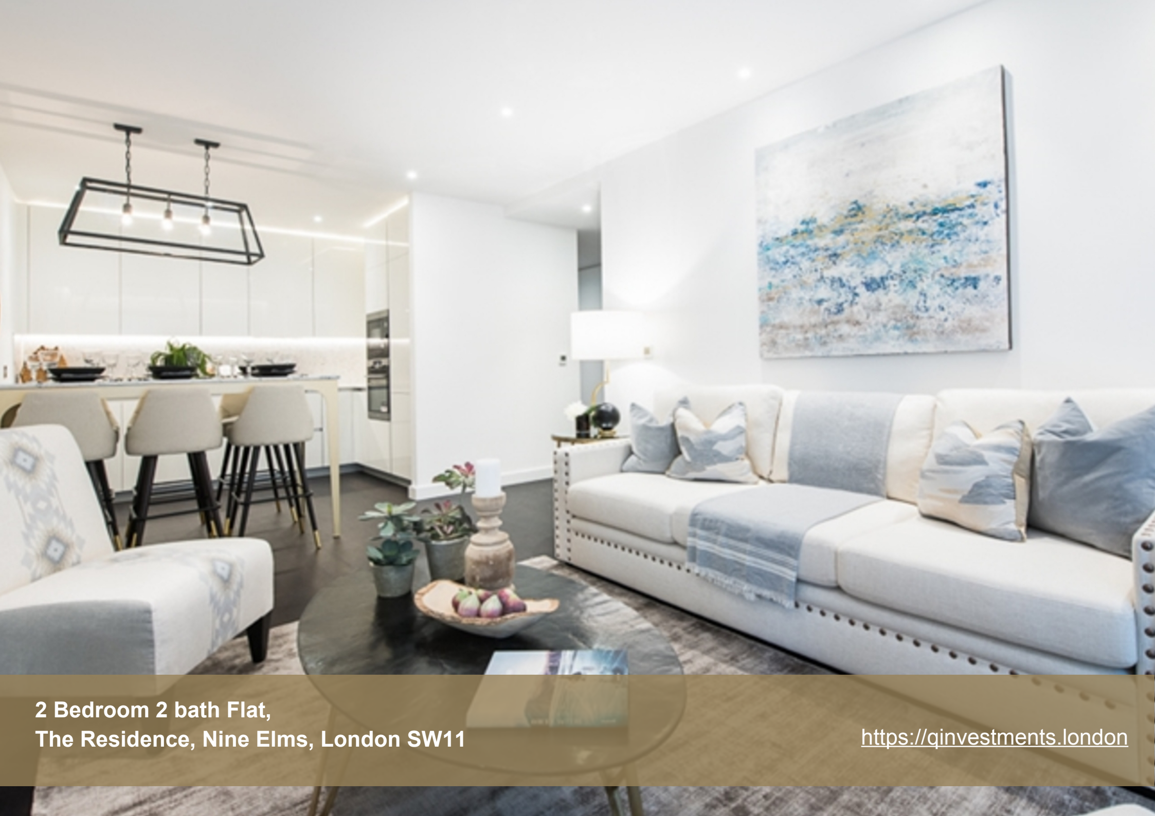
2 Bedroom 2 bath Flat, The Residence, Nine Elms, London SW11