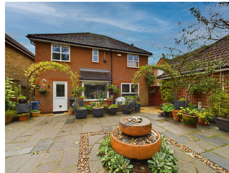
Lyndon Gardens, Totteridge, High Wycombe, Buckinghamshire, HP13 7QJ