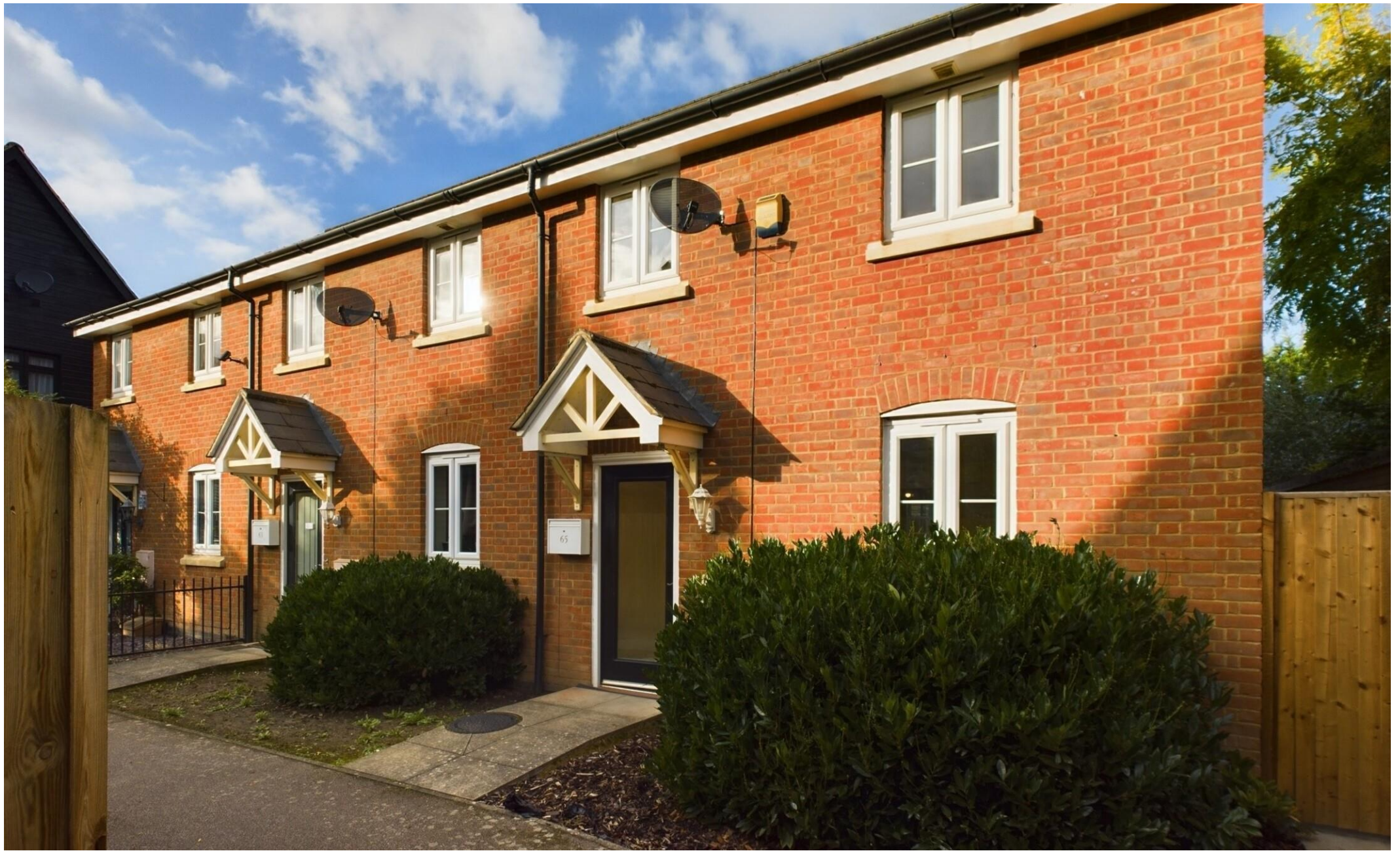
Bourneys Manor Close, Willingham CB24 5GX