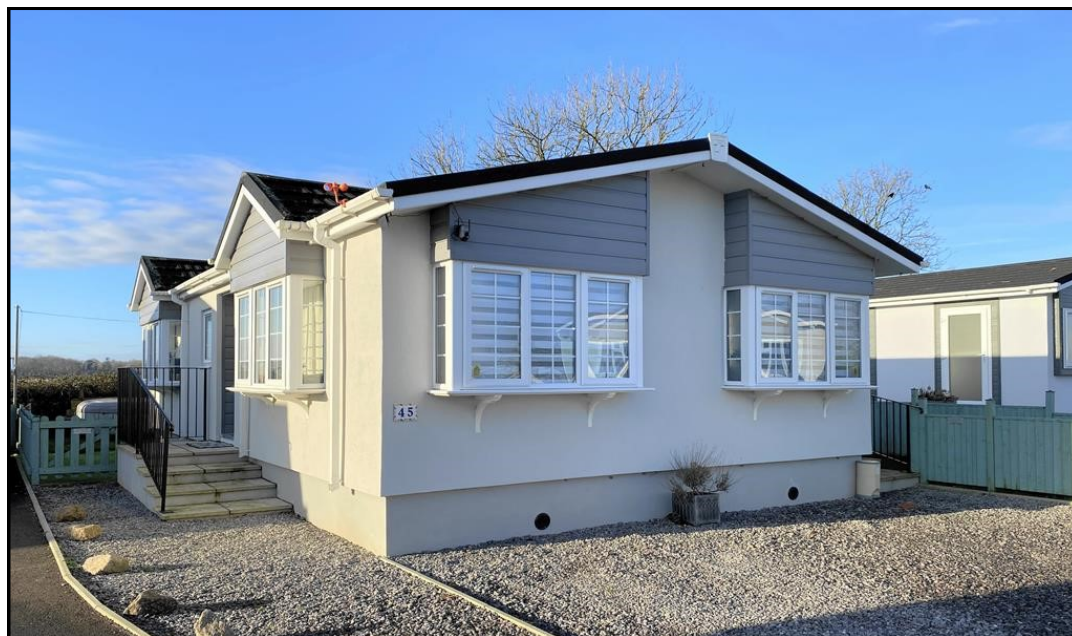
Beautifully Presented Park Home with Wonderful View

45 Bailey View Park, Winterborne Whitechurch, Blandford. DT11 0FD