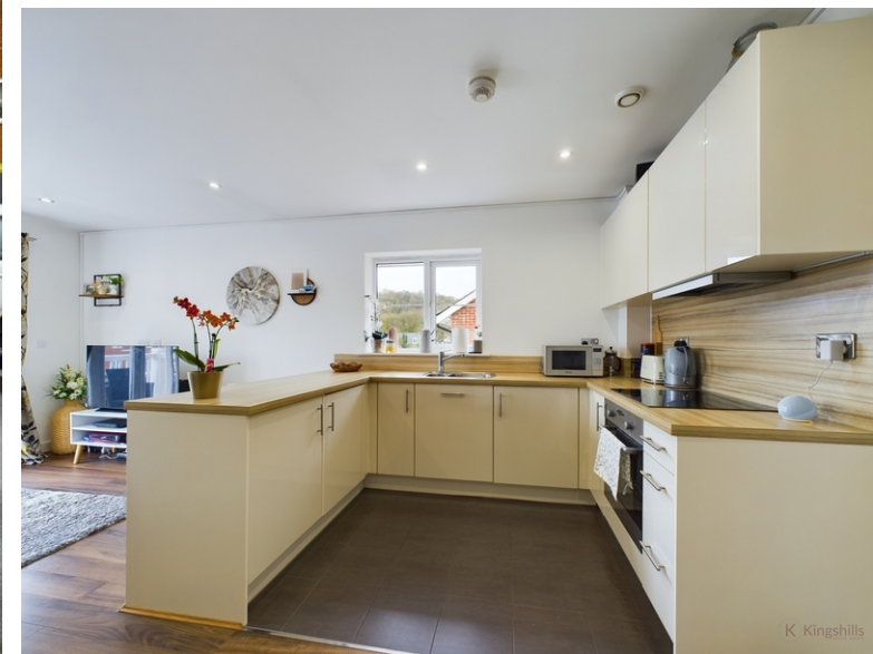
15 Sierra Road, High Wycombe, Buckinghamshire, HP11 1GX