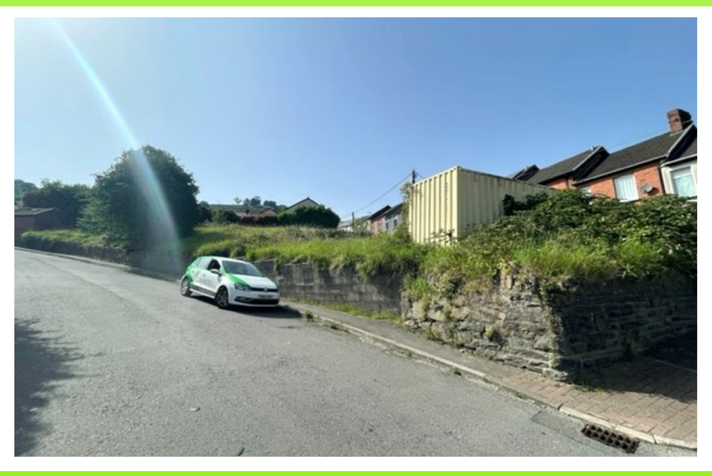
Plot 1 & 2, Land at Oakland St CF45 3AL

22 Oxford Street, Mountain Ash. CF45 3PL 01443 476419 info@tsamuel.co.uk www.tsamuel.co.uk