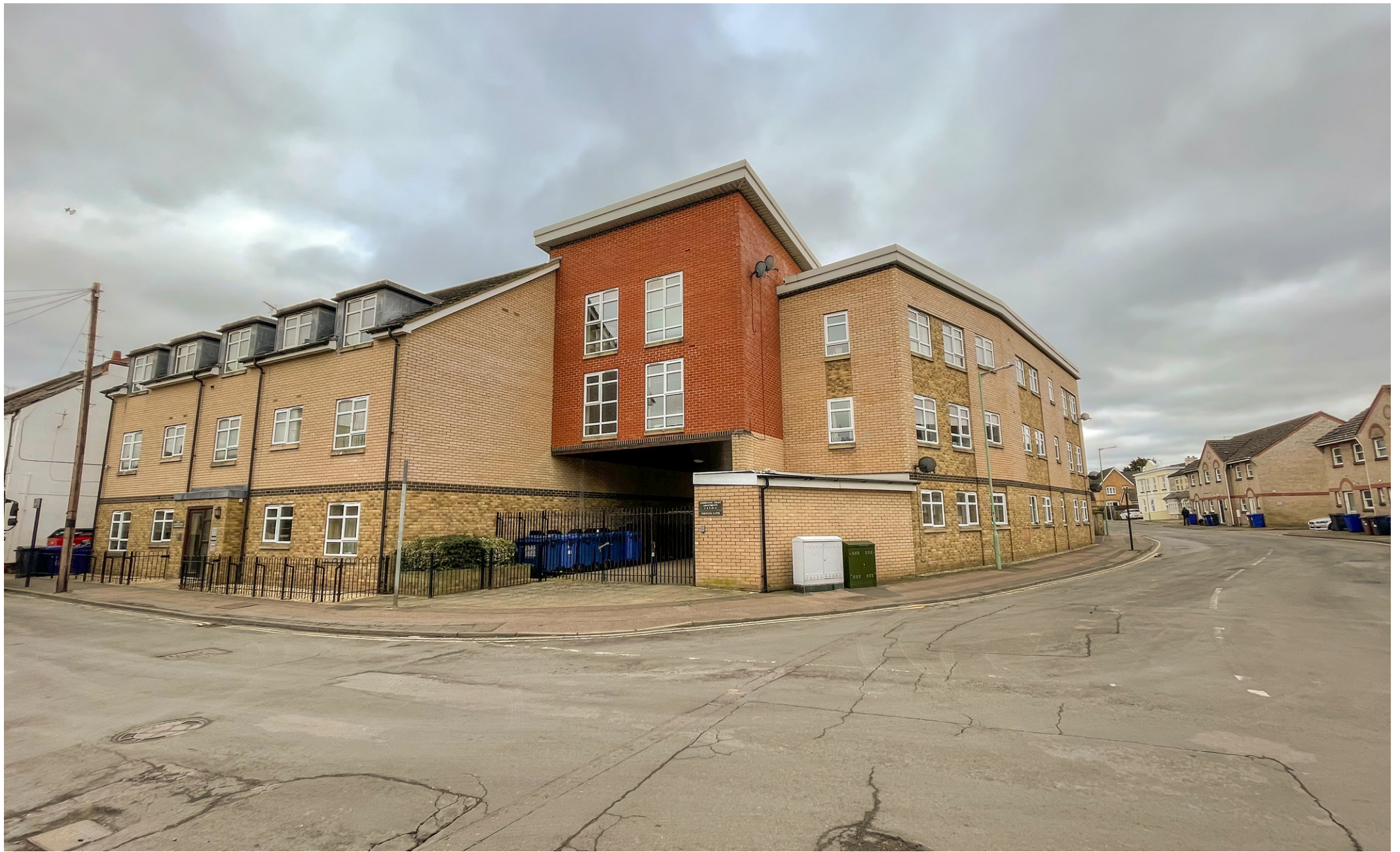
Ashbourne Court, All Saints Road, Newmarket