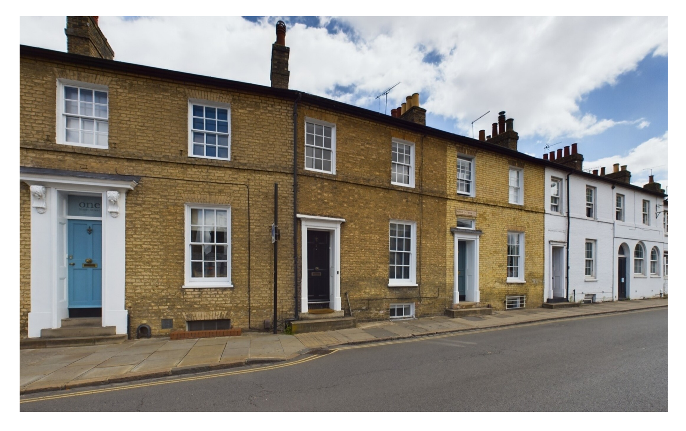
Short Street, Cambridge CB1 1LB