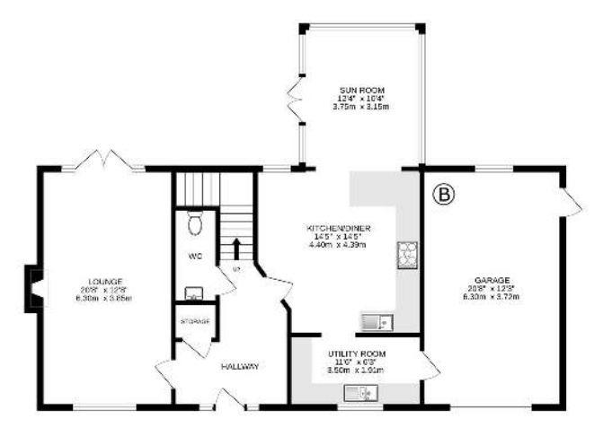
TOTAL FLOOR AREA: 1999 sq.ft. (185.7 sq.m.) approx.

1ST FLOOR 936 sq.ft. (87.0 sq.m.) approx.