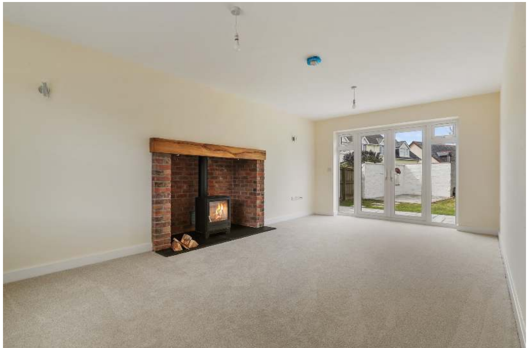
Exquisitely Constructed Luxury New-Build in Llangwm

Tuckedaway Lodge, a remarkable new-build nestled on the outskirts of the quaint village of Llangwm, stands as a pinnacle of modern luxury and thoughtful design. This secluded property combines privacy with an unparalleled attention to detail, reflecting the builders' commitment to superior quality and excellence.