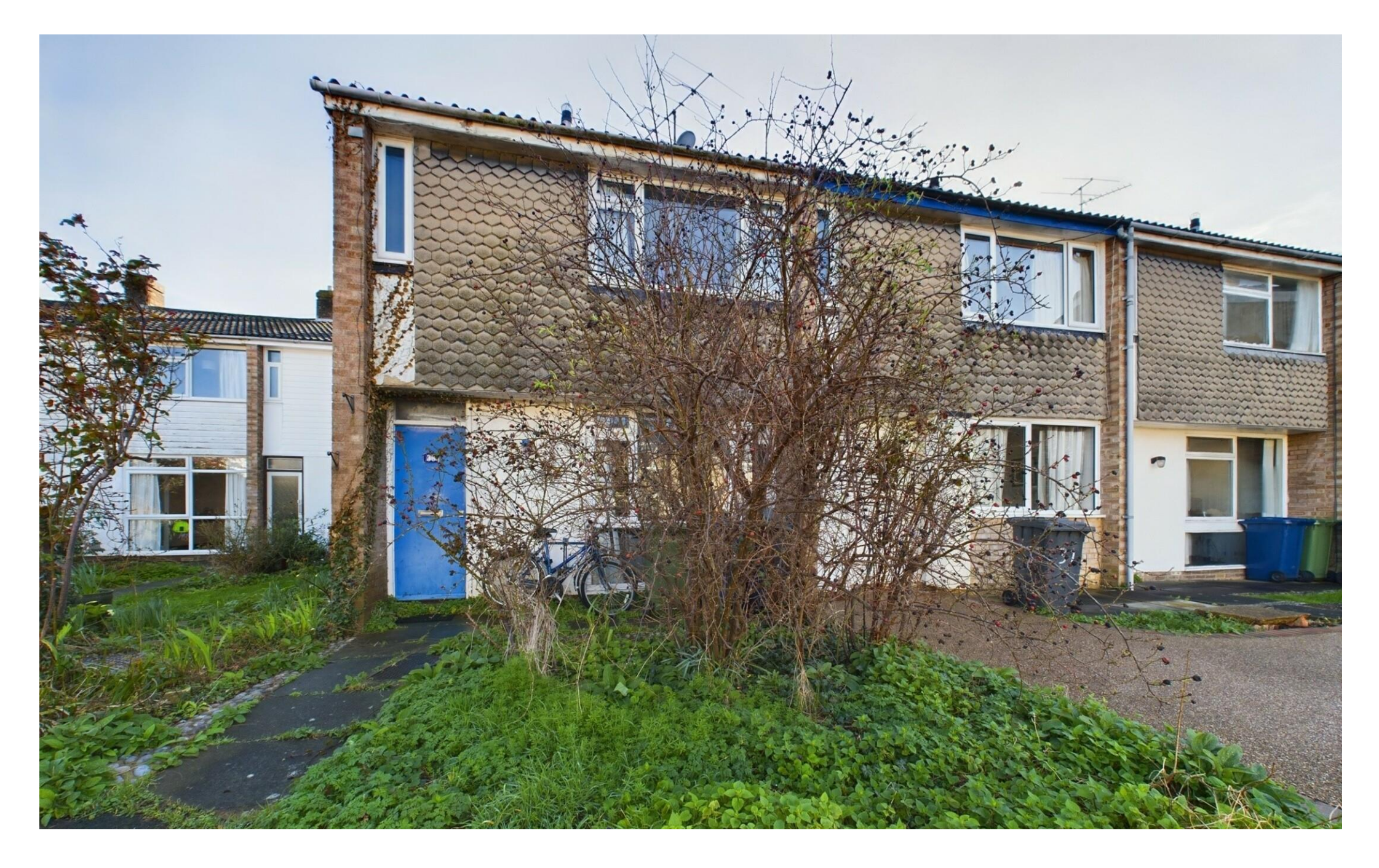
Acrefield Drive, Cambridge CB4 1JW